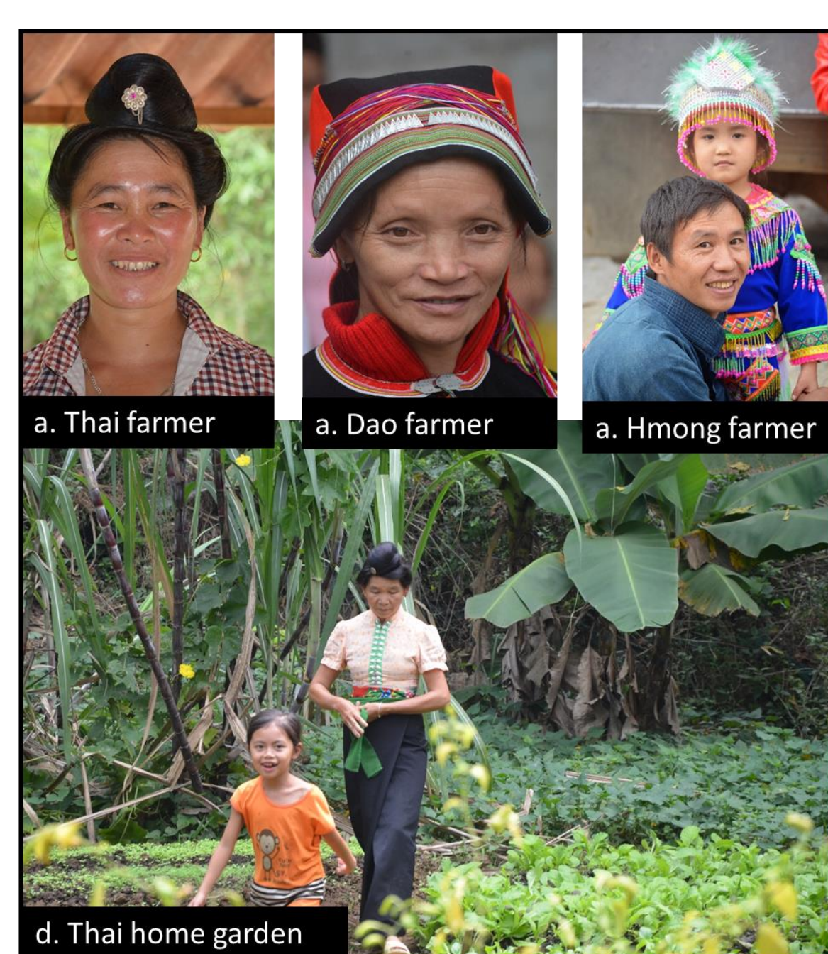
Figure 2: Ethnic diversity in Northern Vietnam

Our project will address these issues by elucidating how, and under what conditions, increased access and use of quality seed translates into enhanced smallholder incomes and nutrition security.