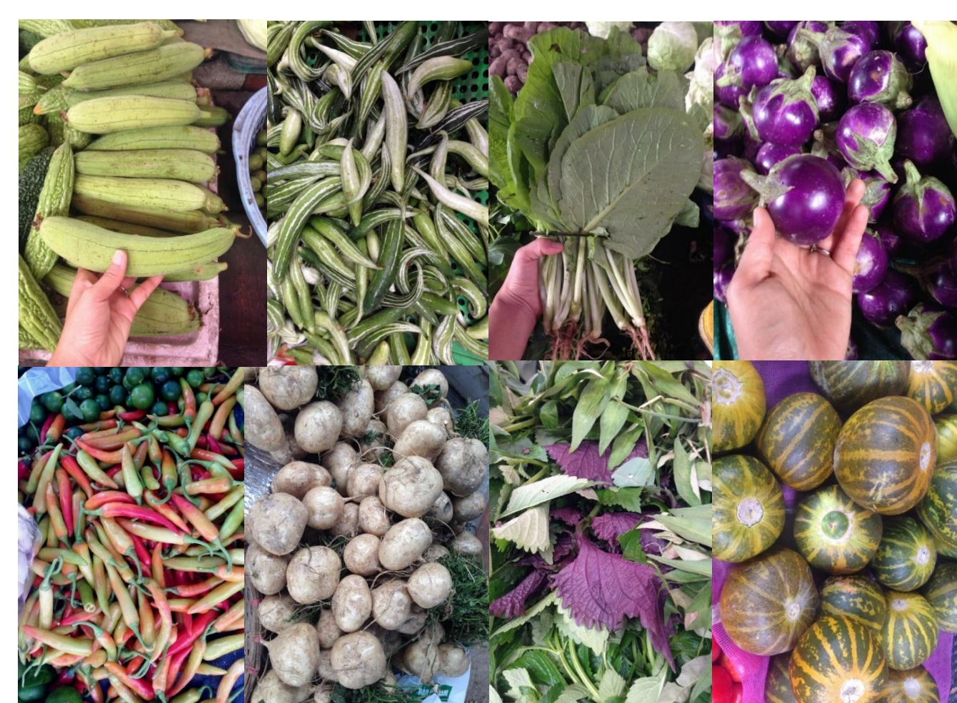
Figure 1: Diversity of Vietnamese vegetables

Vegetables are a main source of income and nutrition for ethnic minority farmers in Vietnam's Northern highlands (Fig. 1 and 2). While value chains for fresh retail produce and seed markets offer huge opportunities for development, current smallholder seed systems suffer from multiple problems. These are due to inadequate access to quality seed, health, and physiological properties, and desirable traits such as disease resistance, micronutrient density, and consumer characters. Insufficient quality guarantees, poor storage, lack of access to appropriate information resources, and limited smallholder participation in seed value chains - combined with the effects of biotic and abiotic shocks affecting seed security - aggravate the situation. Furthermore, endogenous vegetables and farmer seed systems have only received limited attention.