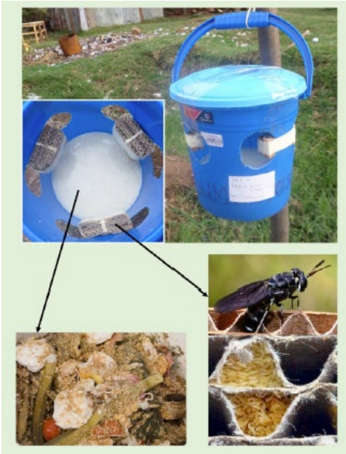
Figure 1: Pictorial of low-cost, on-farm Black Soldier Flies rearing model (icipe/ILIPA)

Yet another project showed that organic waste streams from plants, animals (manure) and the food industry can also be used for rearing black soldier flies, crickets, grasshoppers, silkworms and cockroaches, which in turn are used as feed for poultry or fish (i.e. ILIPA). The insects can upgrade the waste to a higher protein content and can then be used as fishmeal for animal feed. The result of this innovative approach to producing animal feed is two-fold: it provides an answer to waste streams that are now ending up useless in landfills, and, secondly, the approach is particularly relevant for smallholders who often struggle to access affordable, sufficient and high-quality feed (averring 70% of production costs for pigs, chickens and fish farming). For instance, in Kenya, the production of fishmeal from Lake Victoria has proved to be unsustainable and fish stocks from the Lake have gone down, which means that most animal feed is currently imported from abroad, making it more expensive and leaving a bigger ecological footprint. The local production of insect-based feed therefore offers potential to provide a much-needed supplementary feed source. The study showed that Nile tilapia fed with BSF-based feed were 23% heavier than those fed with conventional feed, and the performance studies on pigs revealed similar growth rate, weight gain and blood profile when replacing traditional feed, such as fishmeal, by BSF (i.e. ILIPA).