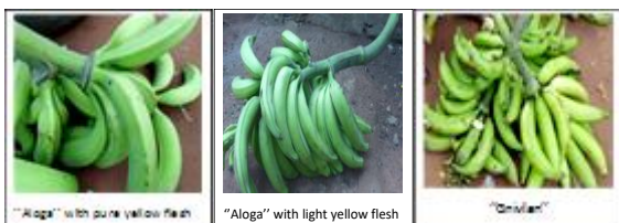
Three most produced and marketed varieties