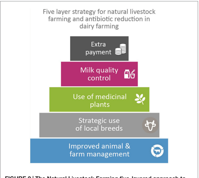
FIGURE 2 | The Natural Livestock Farming five-layered approach to reduce the use of antibiotics and other chemicals in dairy farming.

• Revitalize traditional knowledge on herbal medicine, train veterinarians and farmers, and develop scientific substantiation on remedies and practices concerning herbal medicine in dairy farming, gradually replacing antibiotics and other agro-chemicals with herbal products.