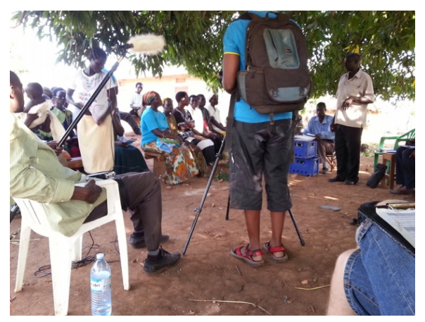
Loro Note En Teko Co-operative – Women sitting on Chairs

We, the research team, arrived at the interview location at the end of the day. We felt pretty exhausted after an entire day of traveling and conducting interviews, but from the moment we left the bus to meet the interviewees a group of women came to us singing, dancing and laughing. You could tell the dynamics in our group immediately changed, and energy was running through our veins again.