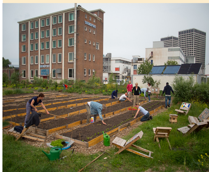
Motivated by social and economic reasons, social housing and real estate companies support local urban agriculture.

The importance of these new players lies not so much in the scale of their interventions but in their contribution to a supportive environment for food initiatives in the city region.