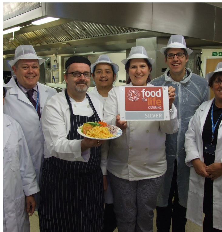
The Food for Life Catering Mark is used by a significant number of public sector buyers (hospitals, schools and universities).

This does not dispute the potential of large-scale processing, retail and catering – because of their scale of operation and financial resources – to drive change.