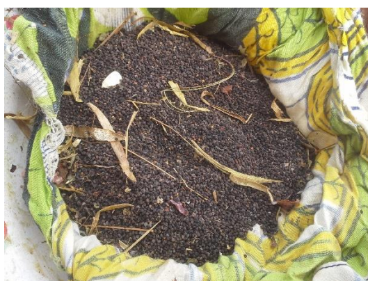
Spider plant seeds stored in fabrics