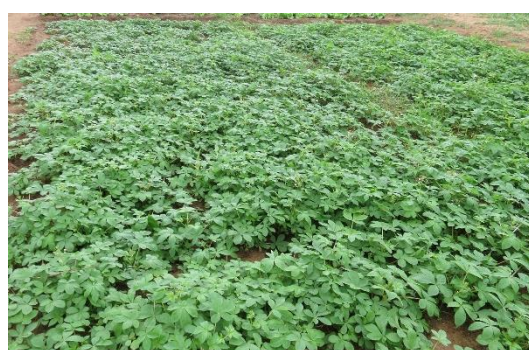
Spider plant home garden in Dogbo