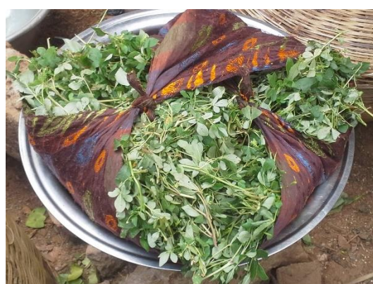
Spider plant for sale at Dogbo market