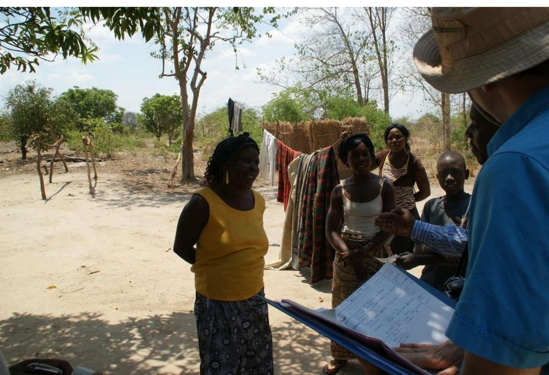
Field interviews on current Mabisi practice in Balaka, Zambia