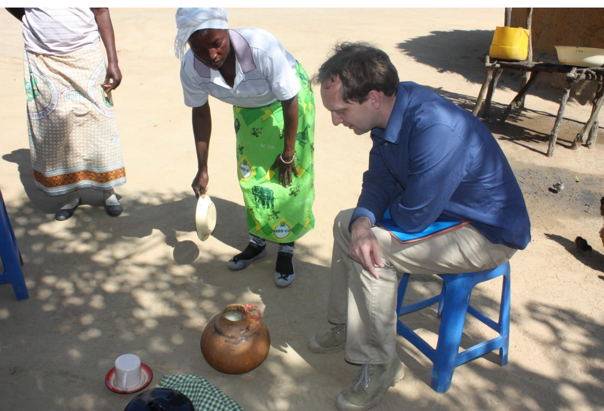
Mabisi production in a calabash of Mabisi in Chibwe, Zambia