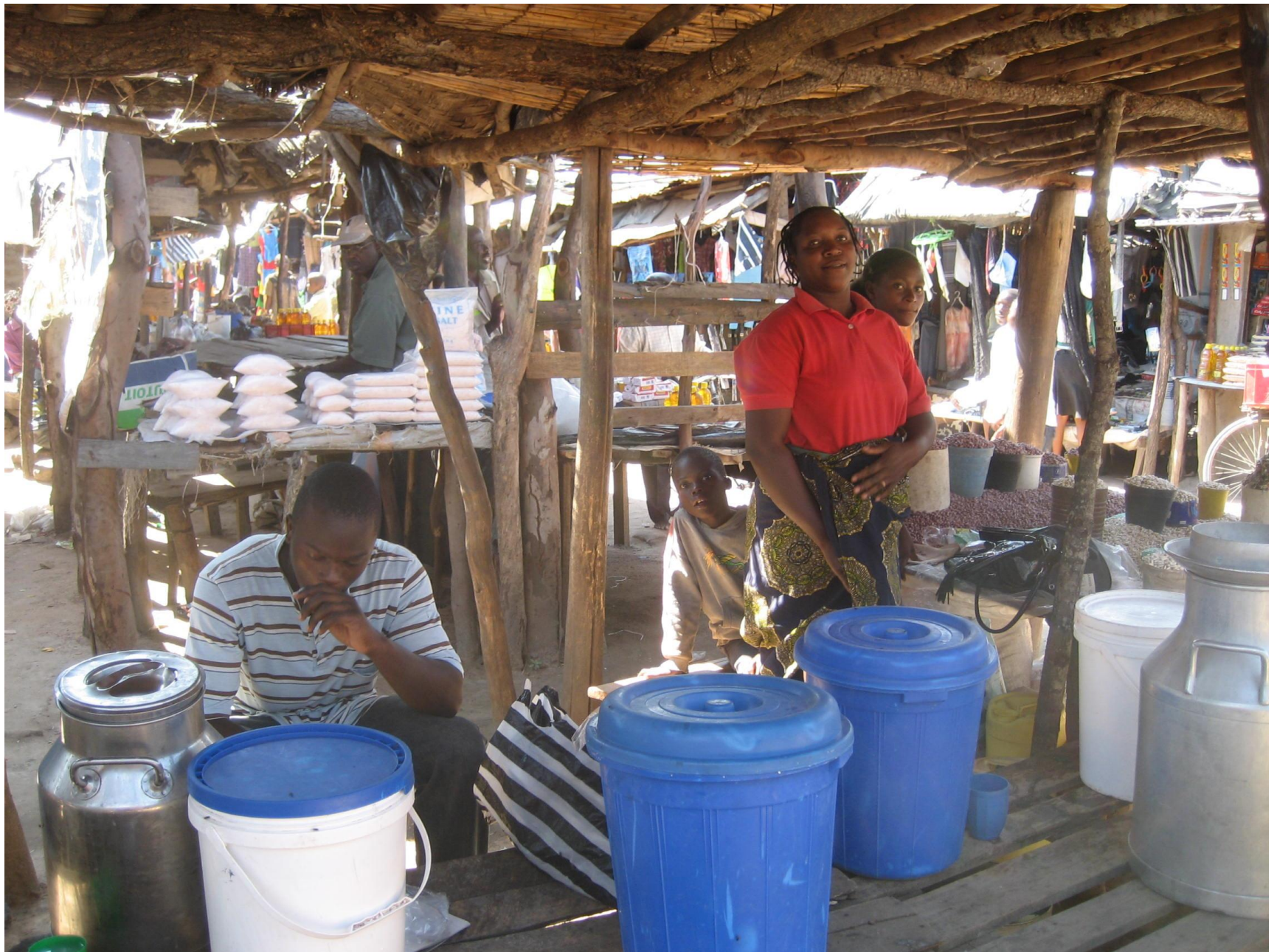
Sellers of Mabisi and Chibwantu/Munkoyo in Choma, Zambia