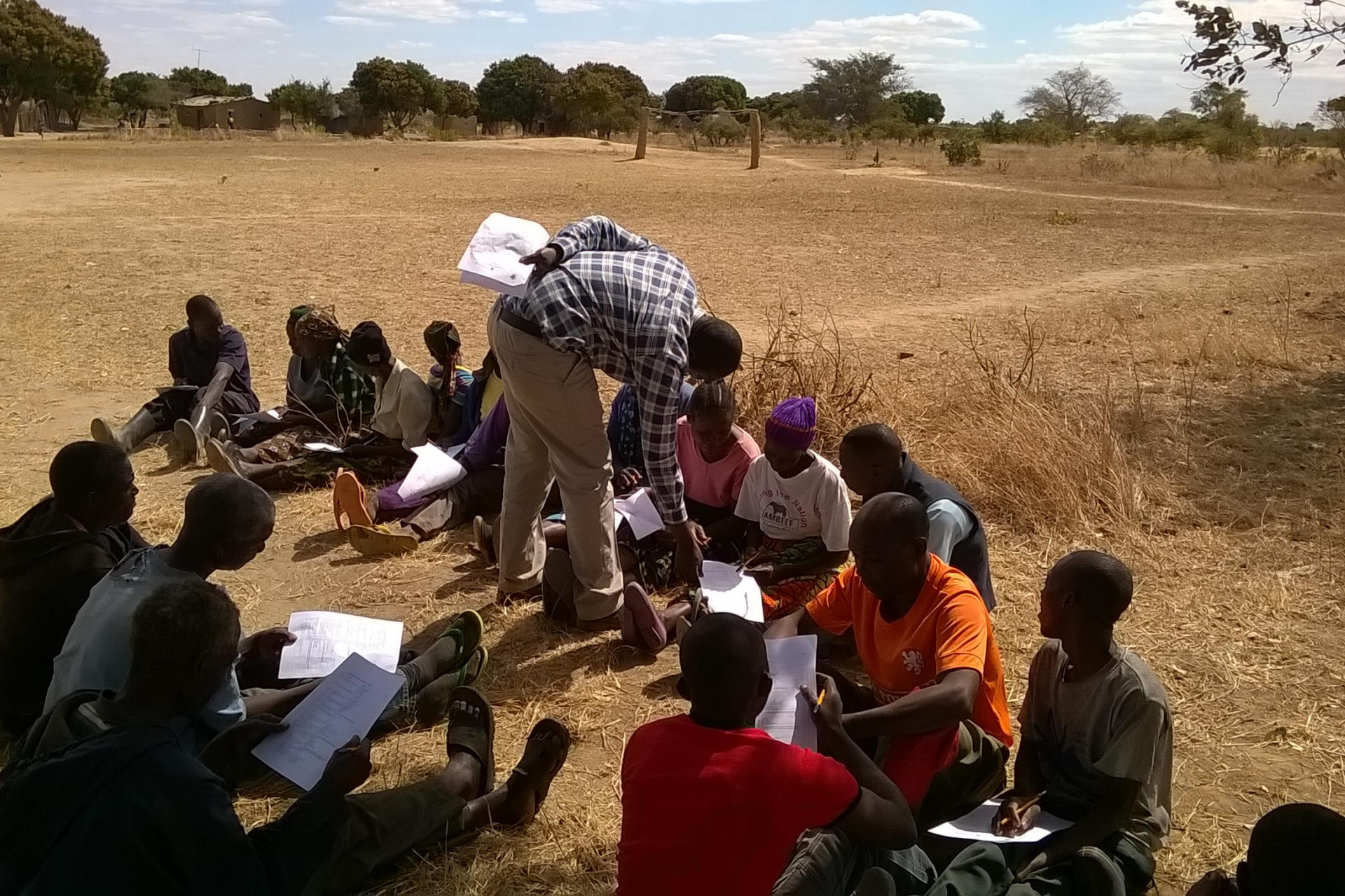
Interviews using questionnaires on Munkoyo processing and preference in Chibombo, Zambia