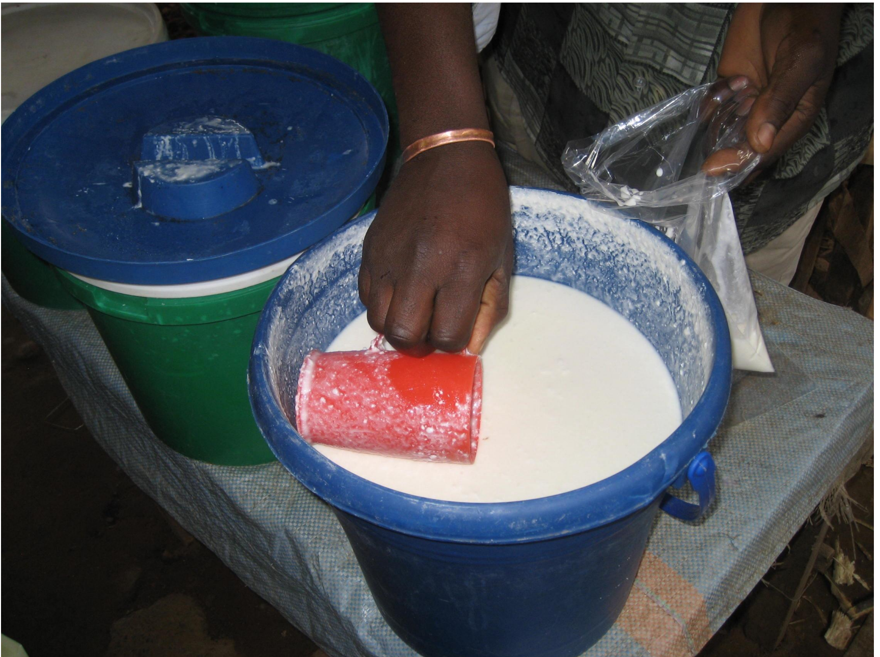
Mabisi sold in Mumbwa, Zambia