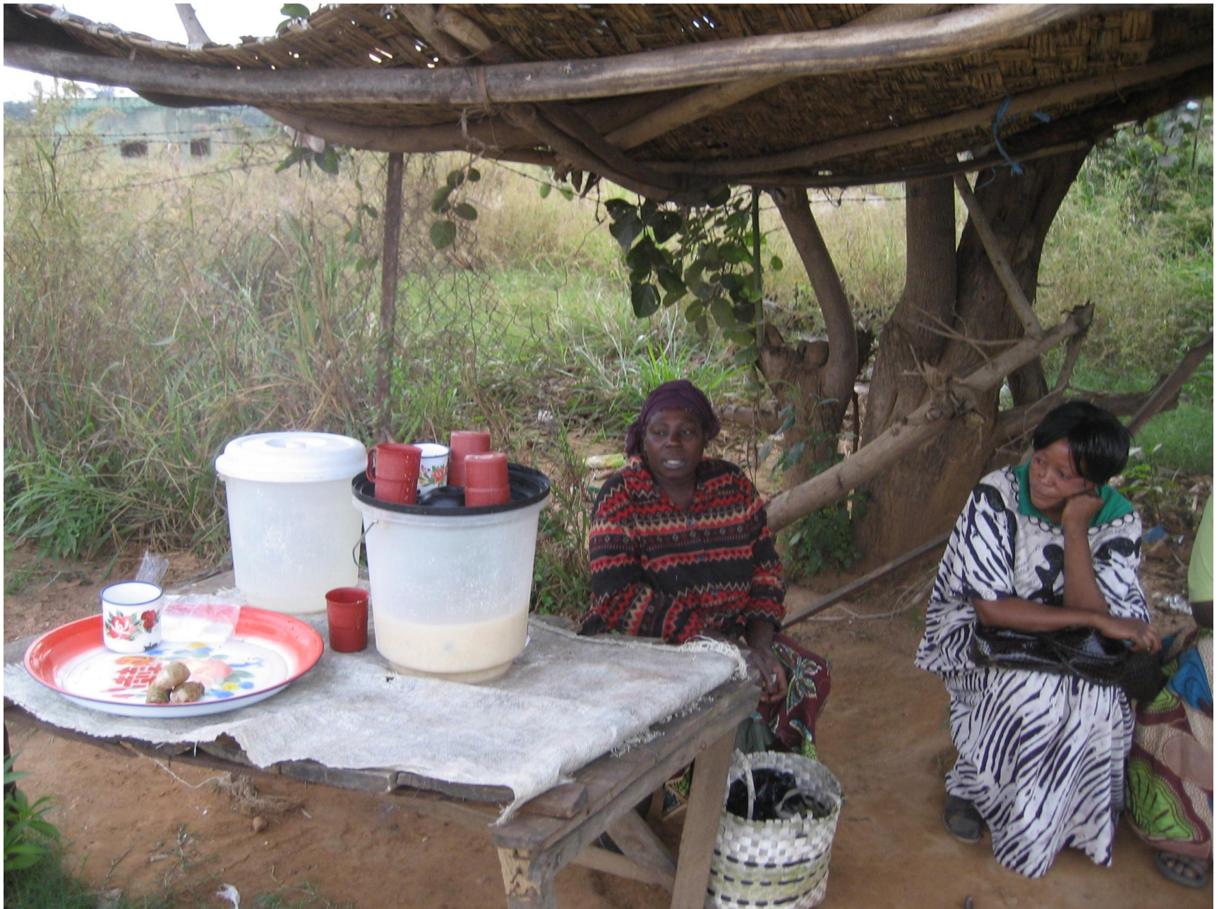
Selling of Chibwantu/Munkoyo along the road side in Mumbwa, Zambia