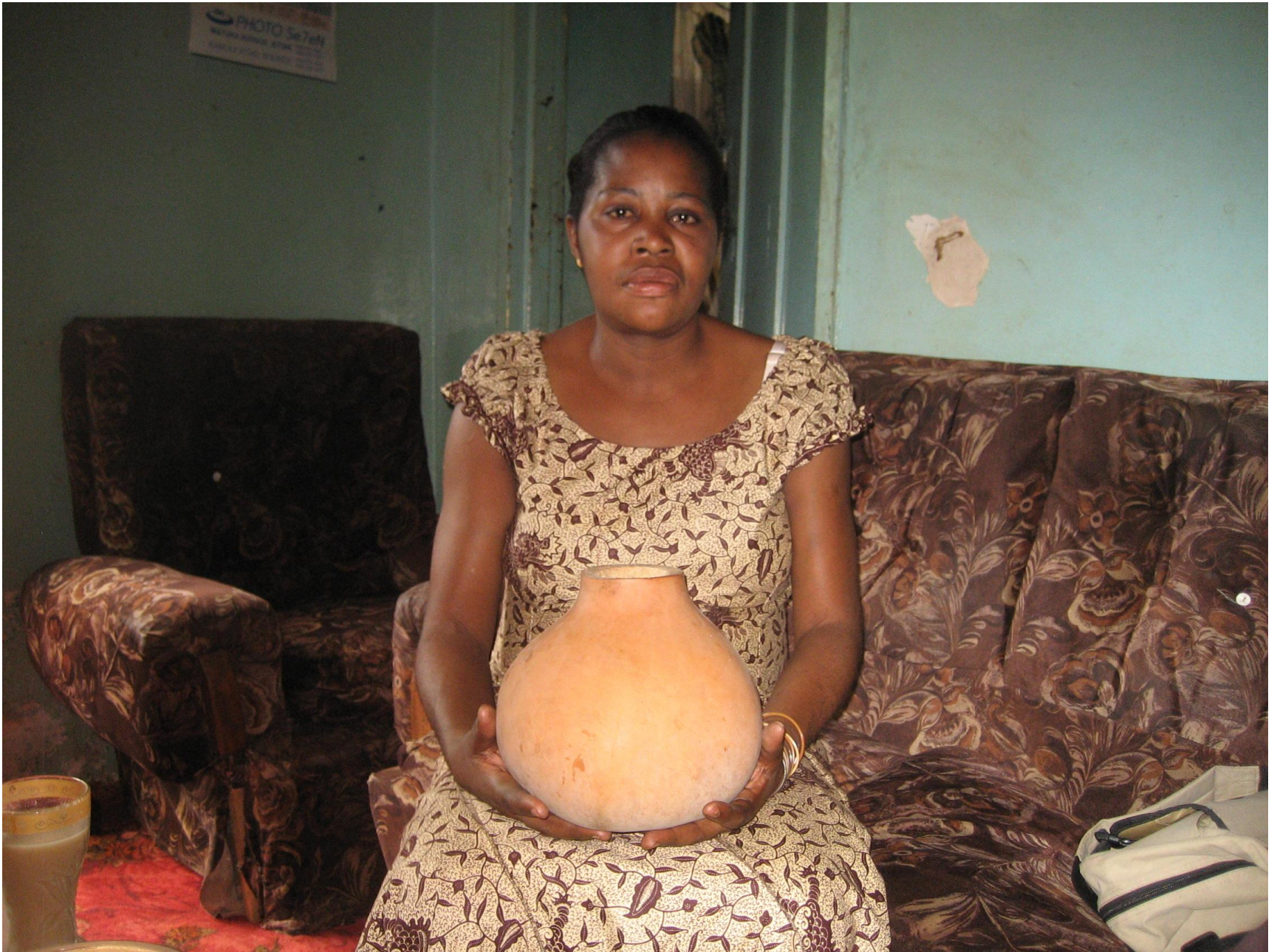
Production at home of Munkoyo using a calabash in Mufilira, Zambia