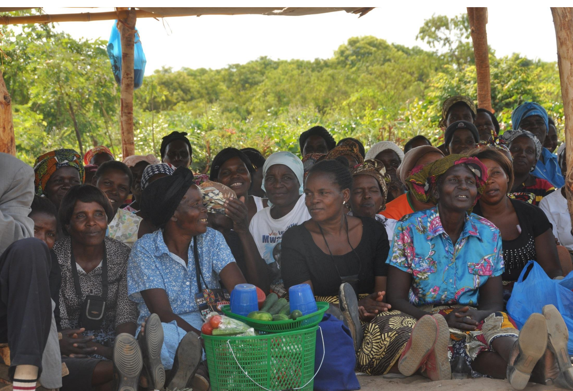
Focus group discussion about Mabisi, Chibwe, Zambia