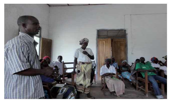
Participatory diagnosis and action planning with Munda-Munda community members in Nante, Maganja da Costa District

This research project has revealed that through facilitation and support, communities can self-organize for empowerment and pro-poor development. Nevertheless, a diversity of power imbalances are in action at the