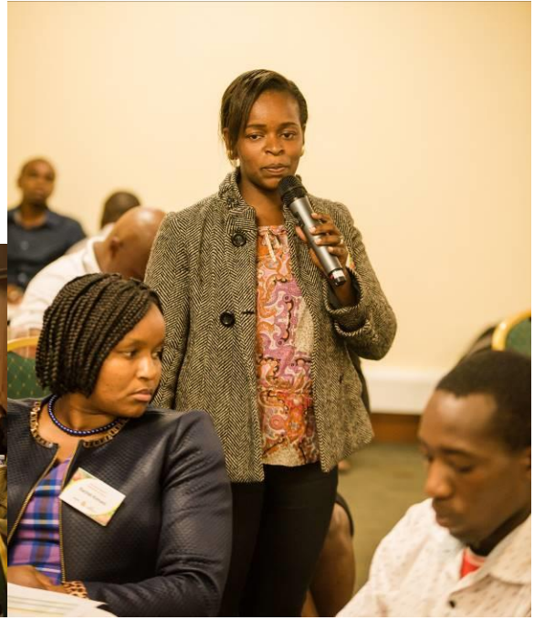
Fig 13: Contributions from the private sector, Royal seeds (Rijk Zwaan) and HM Clause