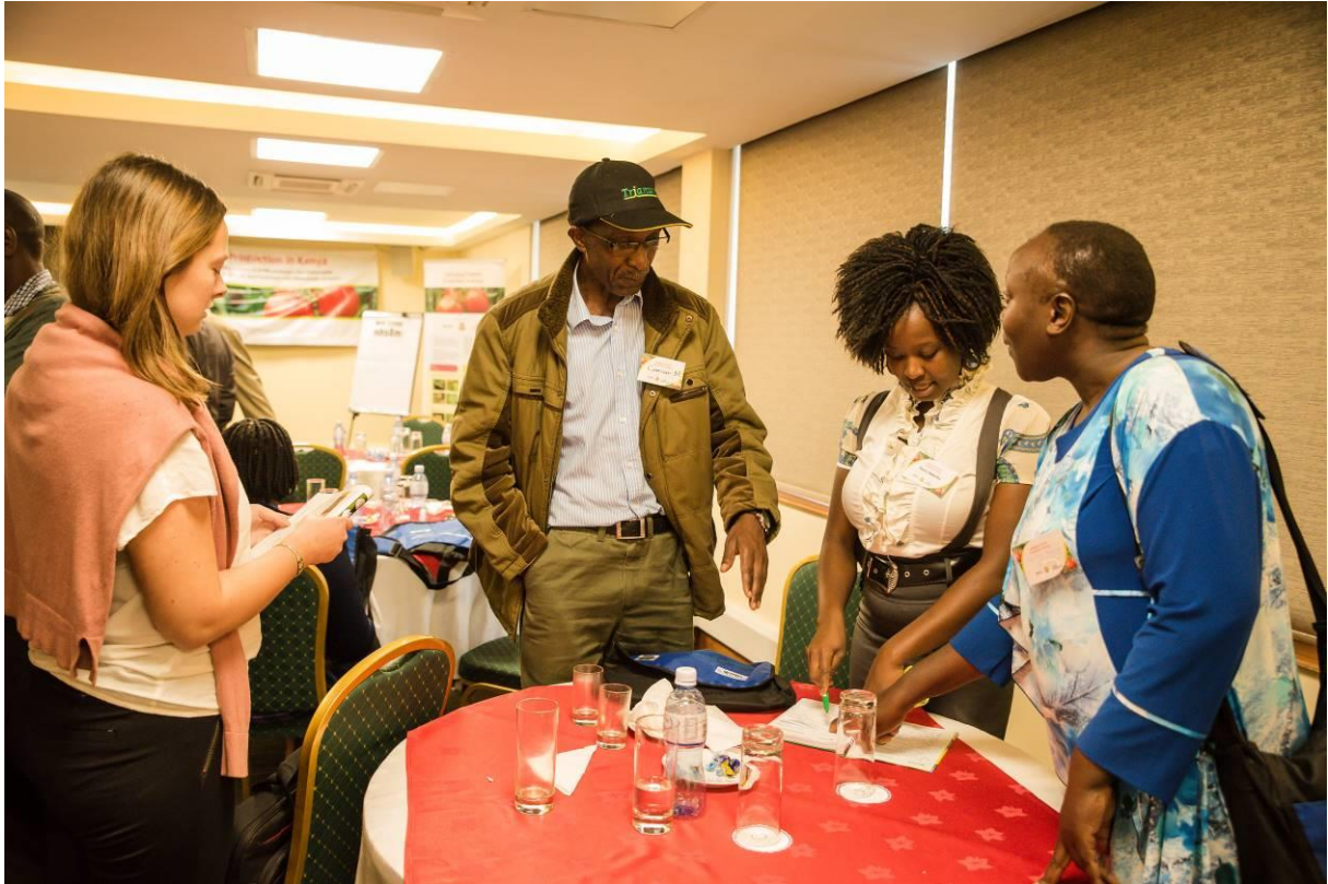
Fig 7: Discussions among participants