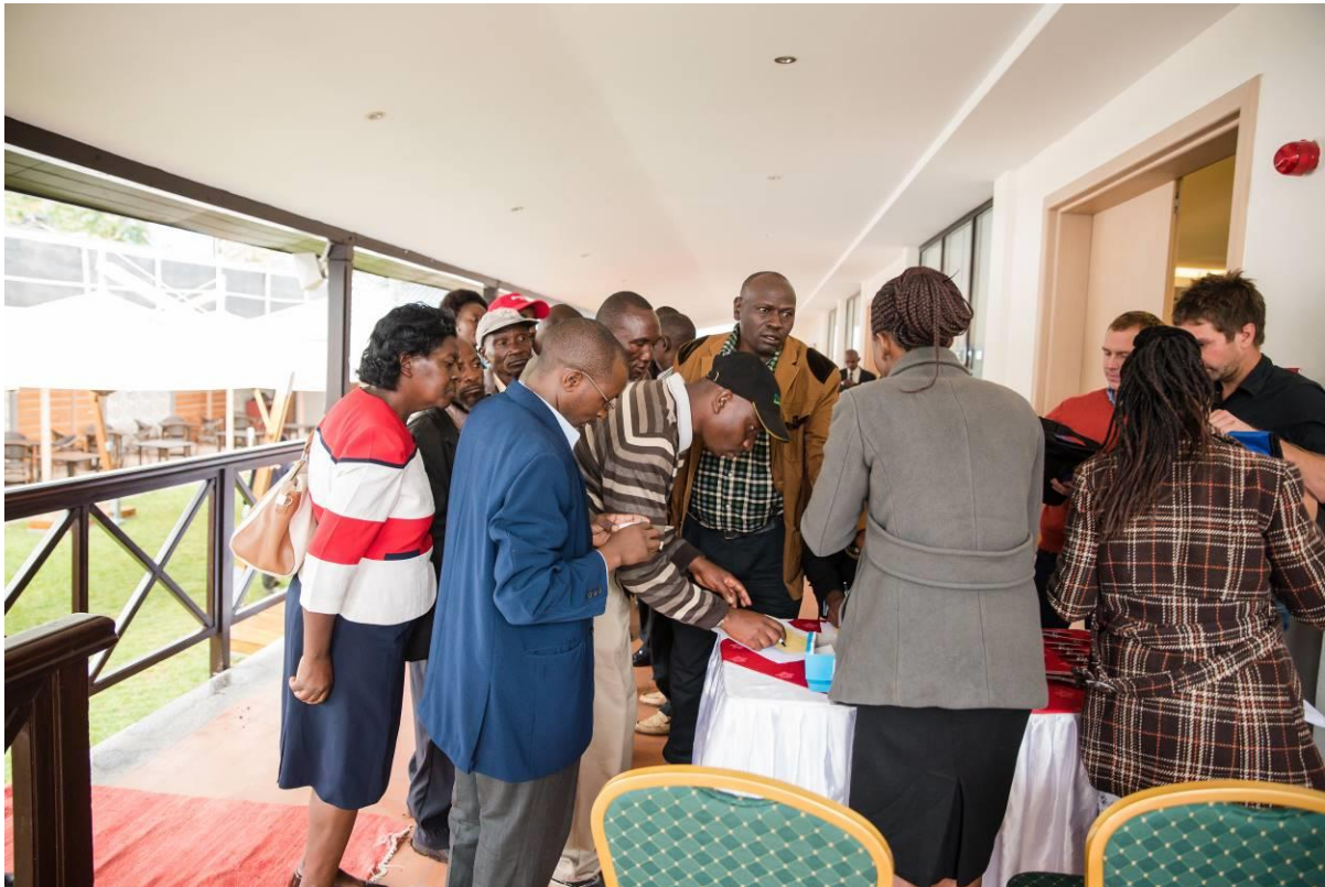
Fig 1: Registration of participants