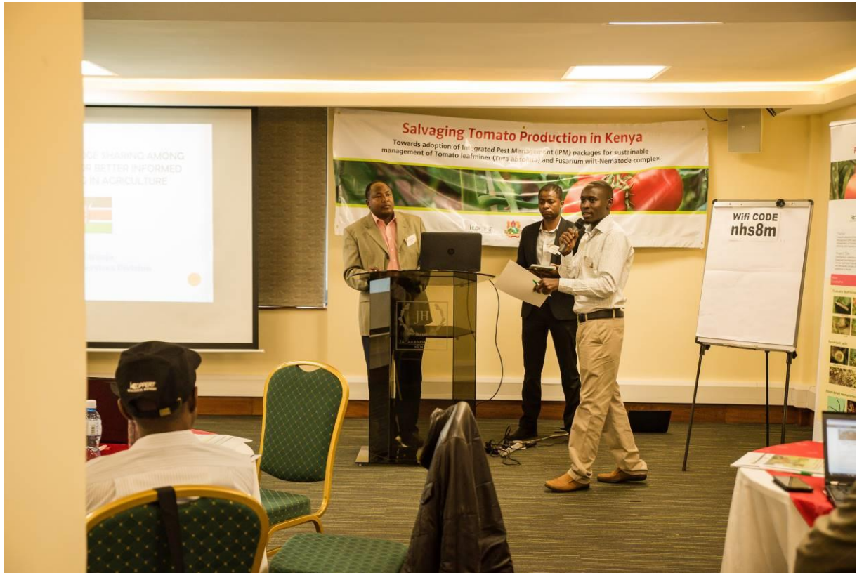
Fig 15: Project team responding to questions from participants