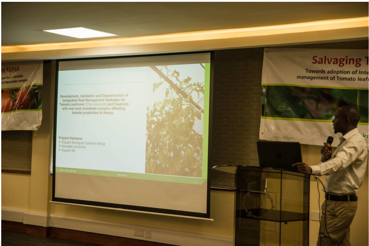
Fig 4: Mr. Evans Wafula presenting year 1 results