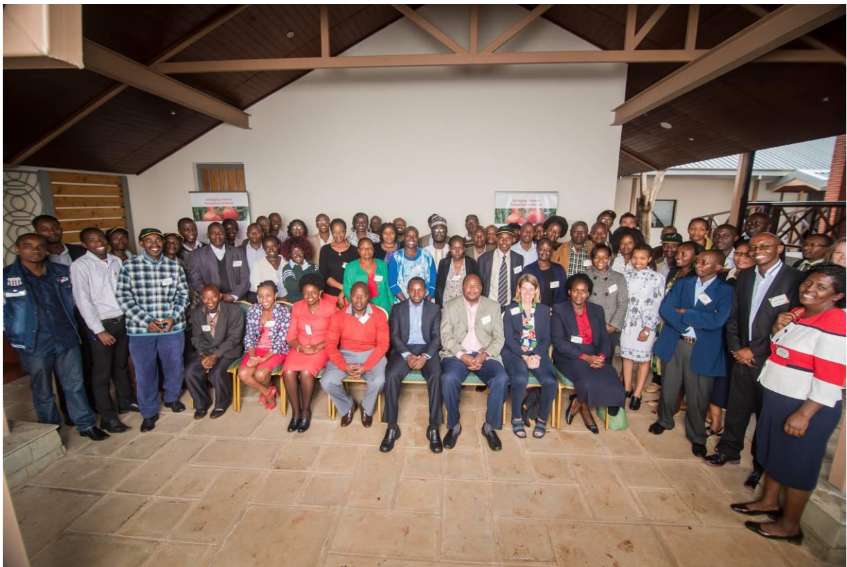
Fig 6: Participants Group photo