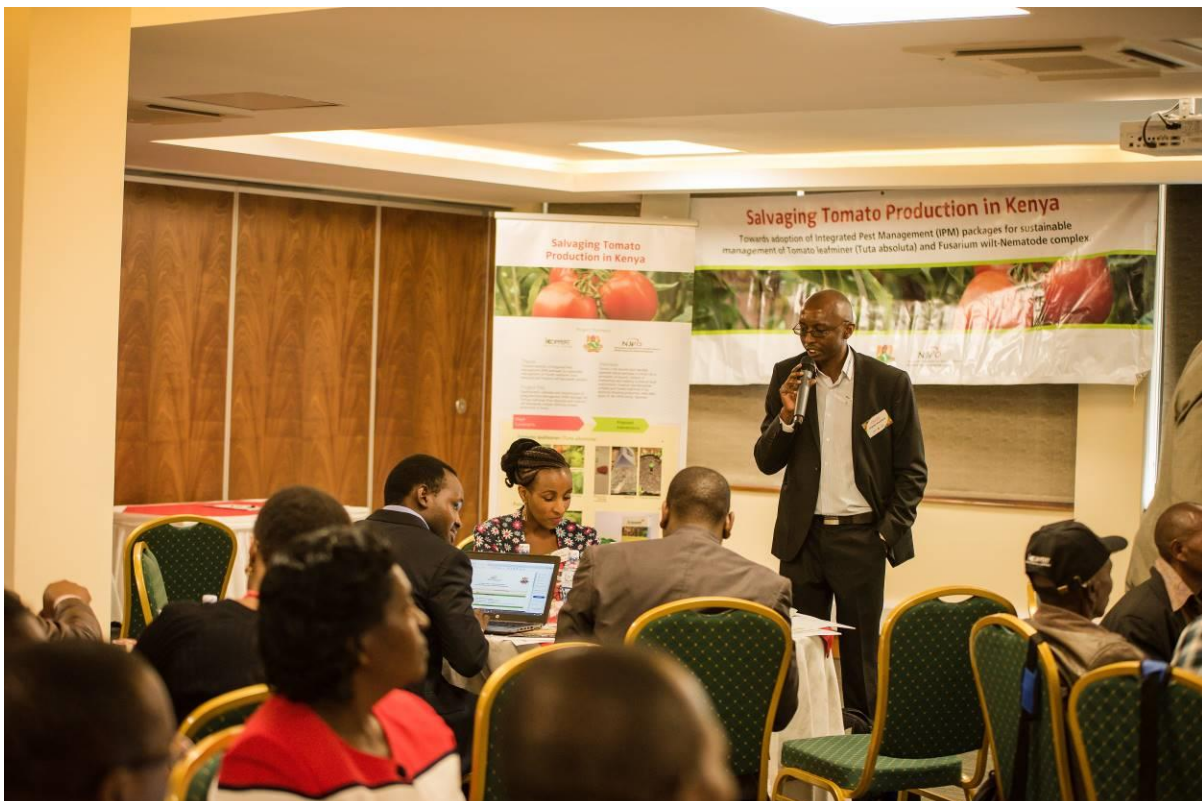
Fig 2: Koppert Kenya General Manager gives opening remarks