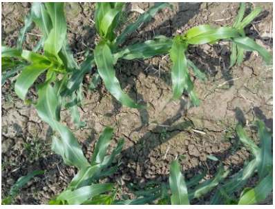
RGB image of ground cover

Method: A mobile app will be developed. This app will enable farmers to take RGB photos of their fields and to get the percentage of ground covered by crops. Various machine learning approaches will be tested to calculate the ground cover estimates. This estimates will be integrated into the Irrigation Advisory System of CIMMYT, which will notify farmers about the water requirements and also inform them about available irrigation service providers.